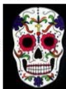
Decorated skull by Taryn Midford

Design and make a decorative calavera or 'sugar skull' like the ones made in Mexico to celebrate the Day of the Dead. $15 - includes all materials. For 5 years+